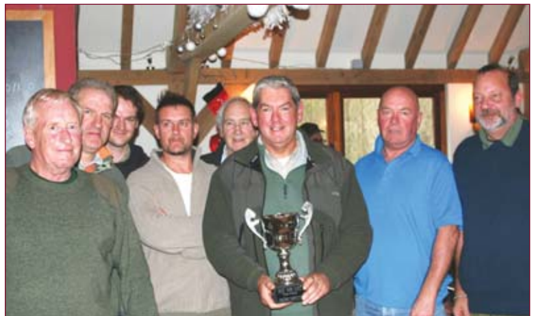
Gents B-team - Winners of the first Brick Farm Christmas Ladies v Gents Competition